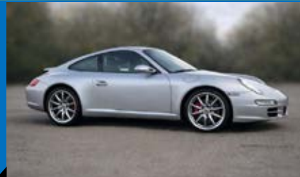
#239 – 2007 PORSCHE 911 CARRERA S

1962 Chevrolet Impala Super Sport, powered by the legendary 409ci V8 producing 409 horsepower, backed by a 4-speed manual transmission—the most desirable drivetrain combination available. This is a 50th Anniversary California car, well-preserved and highly collectible. Features include air conditioning, power steering, and power brakes, offering excellent drivability while retaining the unmistakable performance and presence of a true Super Sport.