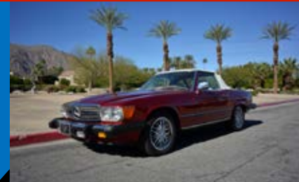
#218 – 1988 MERCEDES 560 SL