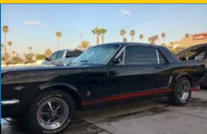
#263 – 1966 FORD MUSTANG GT