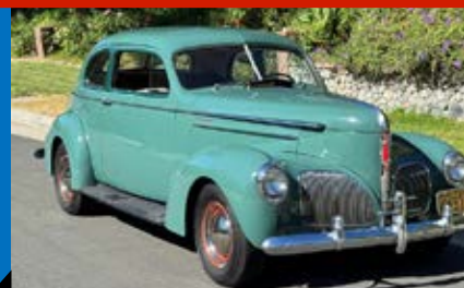
#192 – 1940 STUDEBAKER COMMANDER