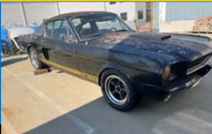
#66 – 1965 FORD MUSTANG