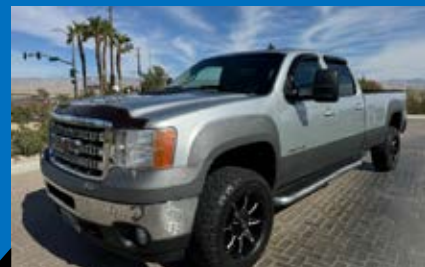
#34 – 2013 GMC SIERRA 2500HD 4X4

Features 400 cubic inch V8 engine, 3-speed Turbo-Hydromatic automatic transmission with Hurst His & Hers shifter. Has black power convertible top. Same owner last 15 years and includes documentation and receipts.