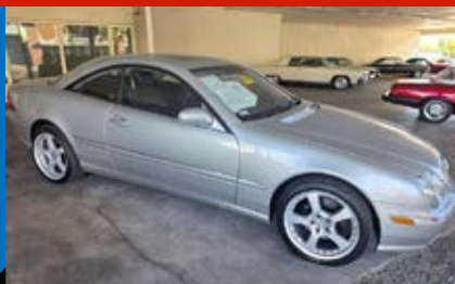
#57 – 2000 MERCEDES CL500