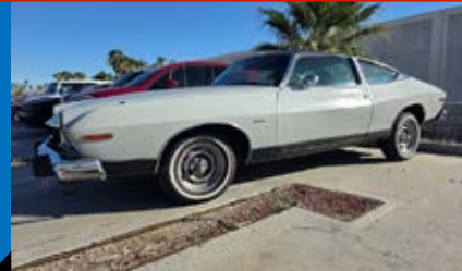
#198 – 1977 AMC MATADOR