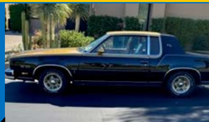
#241 – 1979 OLDSMOBILE CUTLASS W30

This is a 2002 jaguar XKR supercharged convertible with less than 7,800 documented miles. Absolutely mint condition, one owner. Brilliant silver over black leather interior, Clean Carfax, a rare find with these collector like low miles.