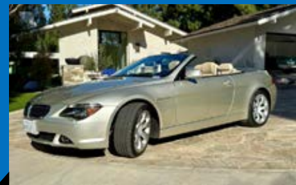
#60 – 2007 BMW 750i CABRIOLET

Has undergone a complete nut and bolt restoration, 95% GM original factory. NOM 396 big block, GM factory Turbo 400 automatic transmission, GM factory deluxe interior with vintage A/C, original SS hood with louvers and factory Rally Sport front grille.