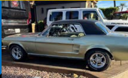
#231 – 1967 FORD MUSTANG