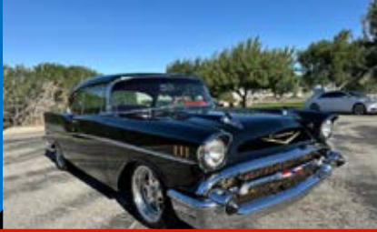
#249 – 1957 CHEVROLET BEL AIR

Very rare Carbon Edition with only 37 imported to the U.S. Features 510hp 5.9 liter V12 engine. Has only 13,000 original miles. All original condition.