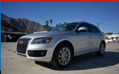
#279 – 2012 AUDI Q5

This is an original Meyers Manx with certification certificate. The chassis is a 1960 VW. The body is 1969 and the motor is 1969/70. Long term storage - recently brought back to life. Has all of the Meyers options including roll bar and Dietz headlights. Levi addition seats. The car was originally constructed in 1970. Sold on a Bill Of Sale Only.