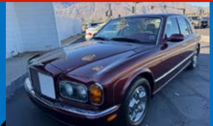
#56 – 1999 BENTLEY ARNAGE