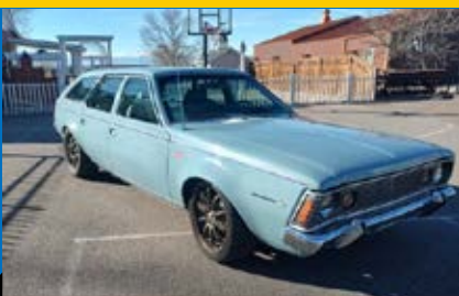
#290 – 1971 AMC HORNET SPORTABOUT