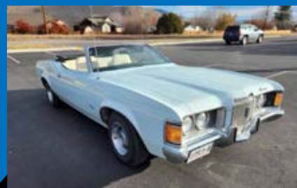
#216 – 1971 MERCURY COUGAR

1969 Chevy C10 Custom Sport Truck (RPO Z84), factory short wide bed (Model: CE10734). 350 V8/Turbo 400. Custom interior with bucket seats. Vintage Air air conditioning. Power steering and power disc brakes. Professionally lowered with engineered lowering parts (ECE). Older restoration but very sharp looking truck.