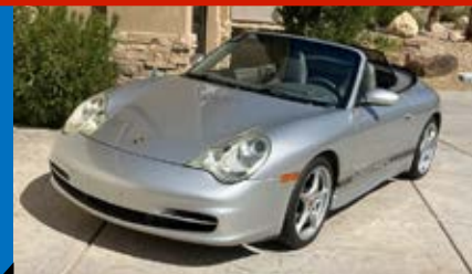
#225 – 2003 PORSCHE 911 CARRERA