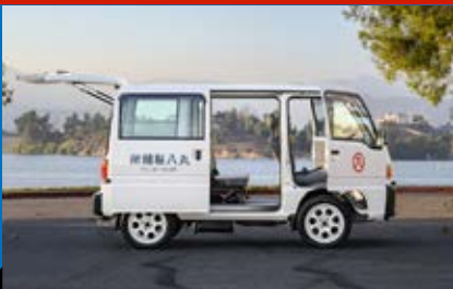
#222 – 1996 SUBARU SAMBAR

This 1968 Plymouth Fury III is a striking full-size muscle-era cruiser, powered by a strong 383 Commando V8 paired with a smooth automatic transmission. Finished in sleek black over a matching black interior, it delivers classic Mopar performance with bold, timeless presence.