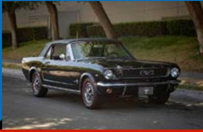
#258 – 1966 FORD MUSTANG CVTBL