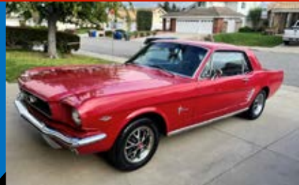
#199 – 1966 FORD MUSTANG