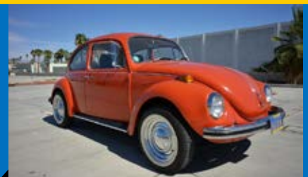
#189 – 1972 VOLKSWAGEN BEETLE

Street Works conversion with ZZ4 crate engine, Muncie 4 speed manual transmission, Fab 9 inch rear end and NOS interior.