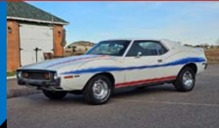
#232 – 1973 AMC AMX