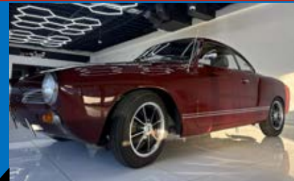
#188 – 1969 VOLKSWAGEN KARMAN GHIA