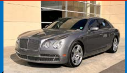
#435 – 2014 BENTLEY FLYING SPUR