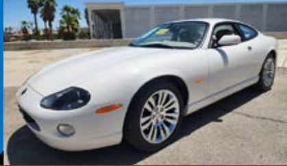
#291 – 2006 JAGUAR XK8 COUPE