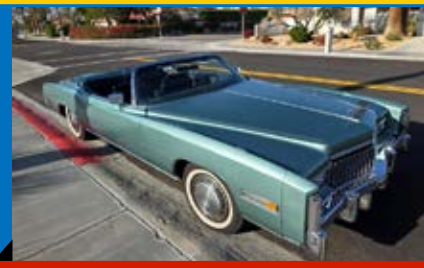
#64 – 1976 CADILLAC ELDORADO

Ford's 1957 Skyliner was the world's first retracting hardtop convertible to be truly mass-produced by a car company from the factory. This stunning example is displayed in glistening Ebony Black exterior, with complimenting Black and White interior, with glistening chrome and gold highlights.