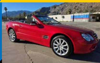
#205 – 2003 MERCEDES 500SL