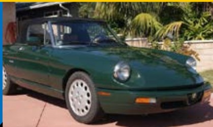
#235 – 1992 ALFA ROMEO SPIDER VELOCE