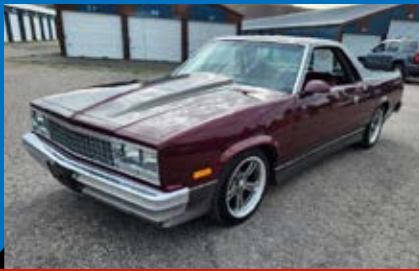
#212 – 1986 CHEVROLET EL CAMINO