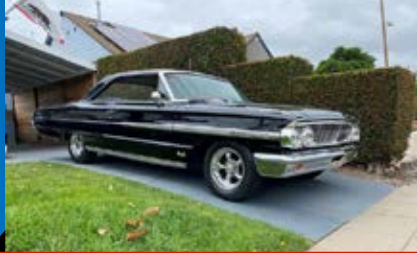
#224 – 1964 FORD GALAXIE 500XL