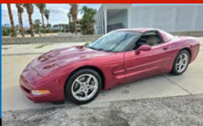
#50 – 2002 CHEVROLET CORVETTE