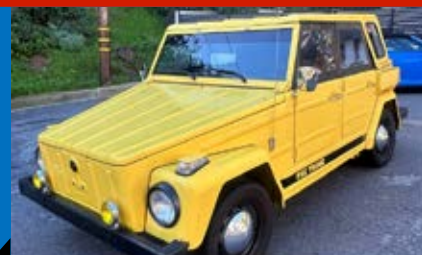
#187 – 1974 VOLKSWAGEN THING