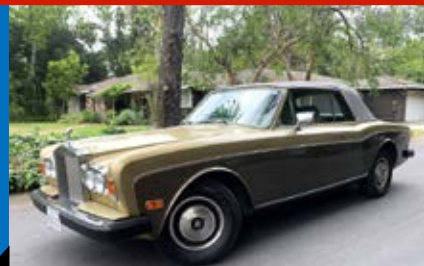
#298 – 1982 ROLLS ROYCE CORNICHE