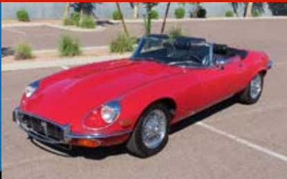
#266 – 1972 JAGUAR XKE