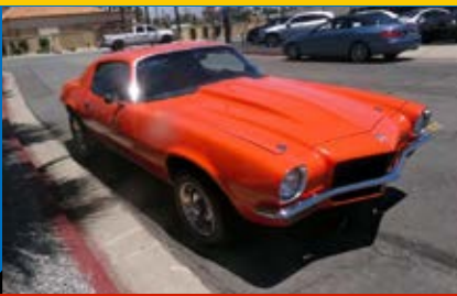
#190 – 1971 CHEVROLET CAMARO