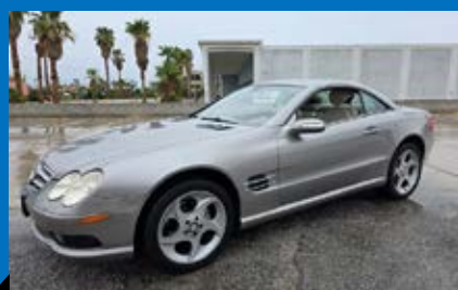
#41 – 2005 MERCEDES SL500