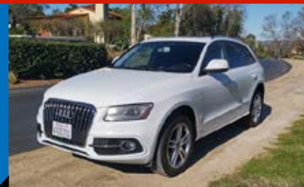
#197 – 2013 AUDI Q5