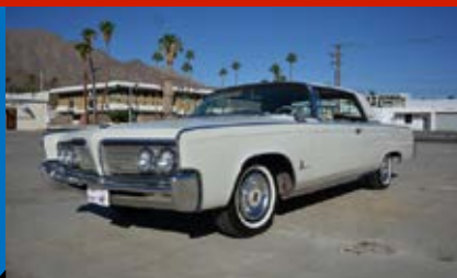
#207 – 1964 CHRYSLER IMPERIAL