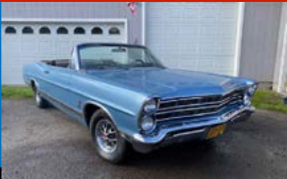
#273 – 1967 FORD GALAXIE 500 XL