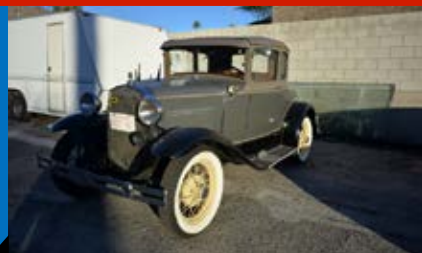
#240 – 1930 FORD MODEL A