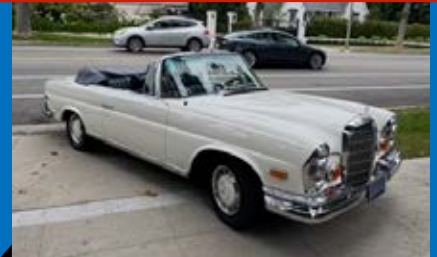
#208 – 1970 MERCEDES 280 SE CABRIOLET