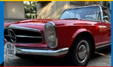
#58 – 1964 MERCEDES 230 SL

Highly sought after Emberglo color with parchment interior and top, rides and drives like new. New Flowmaster dual exhaust.