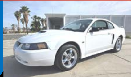
#282 – 2001 FORD MUSTANG