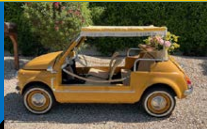
#28 – 1971 FIAT 500 JOLLY CONVERSION