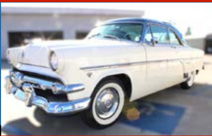
#42 – 1954 FORD CRESTLINE SKYLINER

Beautiful Rare M-3 Convertible with only 66,594 miles. Equipped with a 6 Speed Manuel Transmission, Dinan Exhaust, Traction Control, Stability Control, 4 Wheel ABS System, Air Conditioning, Cruise Control, BMW Assist, Telescoping Wheel, Alpine AM/FM Stereo with Apple Carplay, Harman Kardon Premium Sound, Bluetooth Wireless, Backup Camera, Dual Power Leather Heated Seats, Power Top, Premium Wheels and much more. Looks and runs Amazing. Lots of fun to drive.