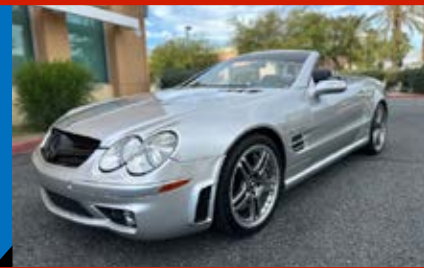
#230 – 2005 MERCEDES SL 65 AMG V12