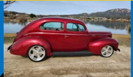
#236 – 1940 FORD DELUXE

289 V8, 3 speed. New paint and suspension in 2024. New seats, new carpet kit, new paint and glass on hardtop Jan 2026.