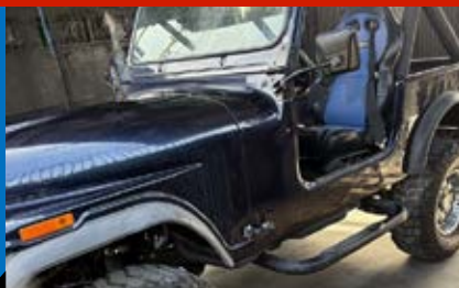
#211 – 1979 JEEP CJ7