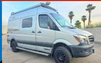
#227 – 2019 MERCEDES REVEL