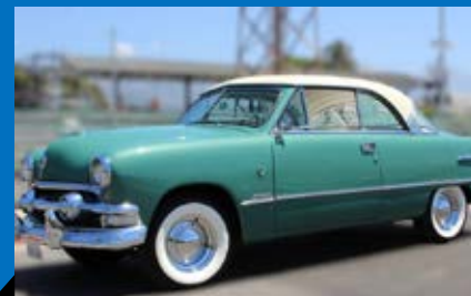
#288 – 1951 FORD CUSTOM

Only 36,700 miles! Paddle shift transmission, Tubi exhaust, custom one of a kind custom wheels.