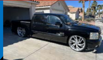
#220 – 2011 CHEVROLET SILVERADO