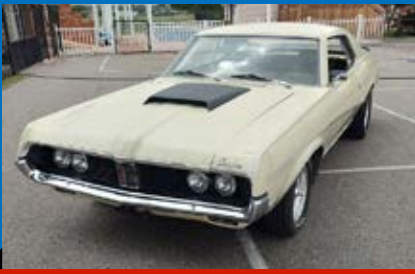
#301 – 1969 MERCURY COUGAR