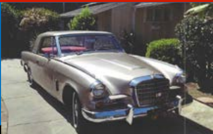
#304 – 1963 STUDEBAKER GT HAWK