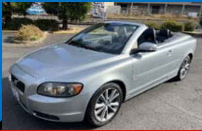
#49 – 2010 VOLVO C70