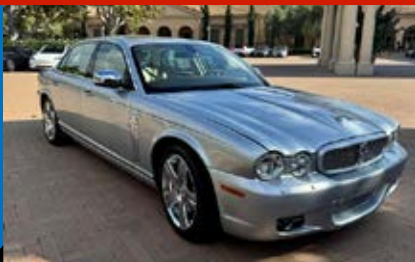
#226 – 2008 JAGUAR XJ8L VP