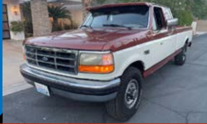
#200 – 1995 FORD F250