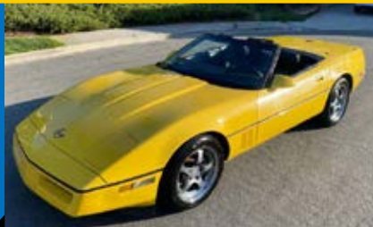
#53 – 1986 CHEVROLET CORVETTE