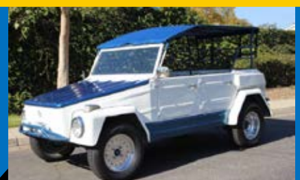
#289 – 1974 VOLKSWAGEN THING