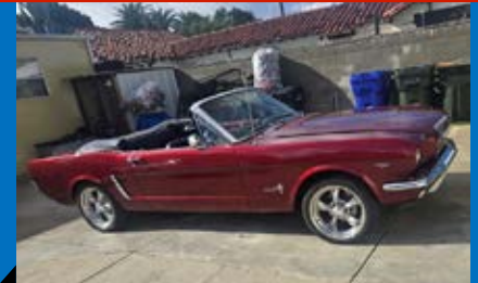
#204 – 1964 FORD MUSTANG